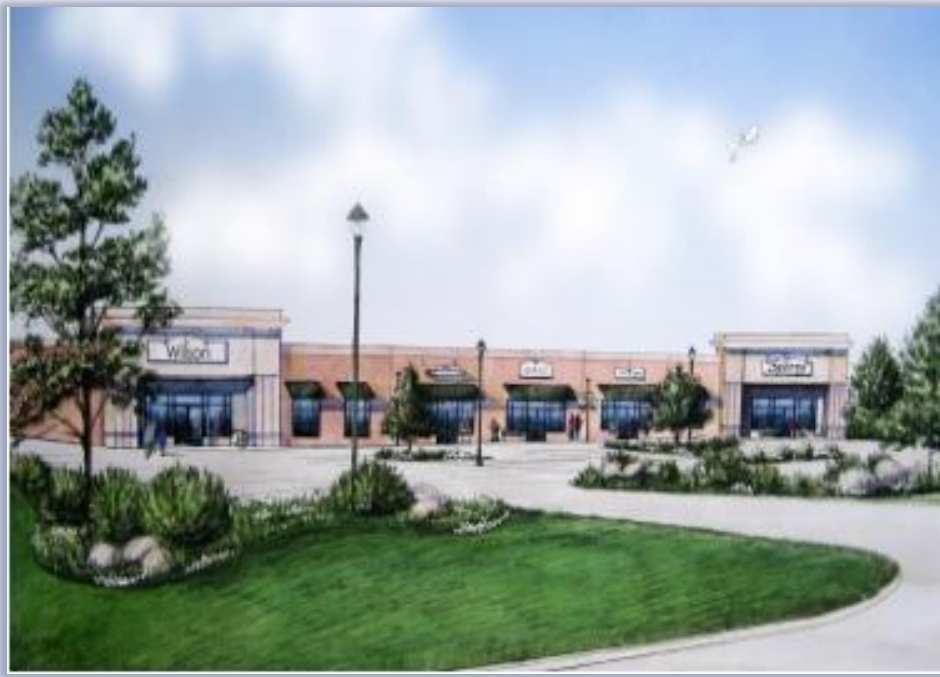
- Conceptual Site Development -